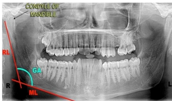
Figure 1: Gonial Angle Measurement on OPG

teeth were in centric occlusion, using a Cephalostat. The x rays were acquired with the Villa Rotograph Evo D OPG system by Villa System Medical. The patients were exposed to a voltage range of 73kv-15ma to 84kv-13ma, following universal protocols while ensuring a natural head position. In the 100 chosen samples, the names were obscured on the radiographs. All lateral cephalometric radiographs were manually traced on acetate paper using a 3H pencil on a transilluminator. A geometrical protractor and a ruler were employed to determine the gonial angle. The gonial angle on the OPG was assessed by drawing a straight line to the base of the mandible and the most distal point of the condyle and ascending ramus [13] on both sides and then taking an average value of the two (Figure 1).