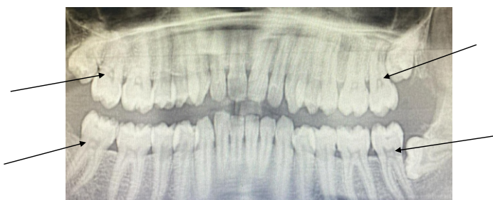
Figure 2: The Panoramic Radiograph from the Upper and Lower Jaw Teeth Shows many Free Pulp Stones inside the Pulp Chambers

Panoramic radiograph displaying multiple free pulp stones in the pulp chambers of upper and lower teeth (figure 2).